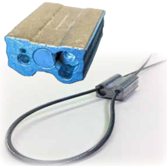
Falcon LockGrip LG-3 provides a two way grip of 1/8" (3mm) wire rope for a variety of bracing applications.

In addition to high load capacity, the LG-3 utilizes patent pending Dynamic Vibration Arrest (DVA) technology. Engaged by tightening the lock-screw, a secondary clamp is positioned to pinch each wire against the case (in addition to the primary wire grip(s)). This ensures the entire device vibrates in unison with the wire. Without DVA, in the case of wind or other vibration, a wire grip can shake loose, allowing the tie to fail. DVA prevents vibration failure. LG-3 grips provide the highest level of safety with the easiest installation and widest application portfolio of any gripping device.