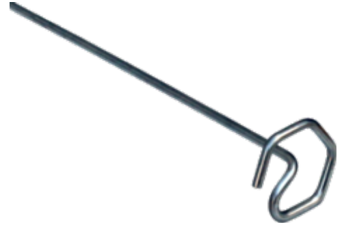
HP Pin Dimensions - in (cm)

Falcon Pins by Western Green are a fastener designed to secure erosion control mattings in place with improved pull-out strength. The Falcon HP Hex Pins have a unique hexagonal shaped head and lengths of 6", 12" or 18" configured using a 0.16" (4.0 mm) diameter wire. The integrated hex head can replace the need for a washer/pin combination. With the hex head shape, the HP pins are easy to install by hand, mallet, magnetic staple stick, or using a hand drill with a 1.5" socket attachment or a custom driving socket. The Falcon HP pins are galvanized and made in the USA.