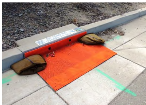
Anchored with Gravel Bags or Zip Ties