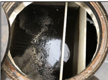
TOP VIEW WITH COVER REMOVED