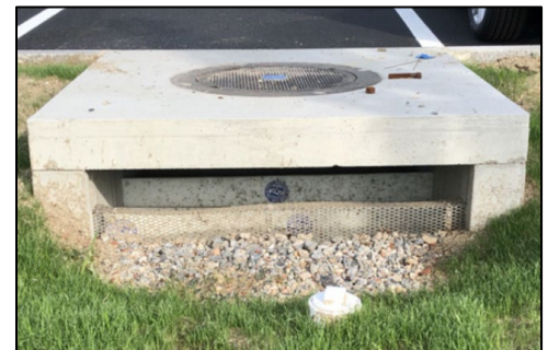
REAR VIEW OF OUTLET SCREEN