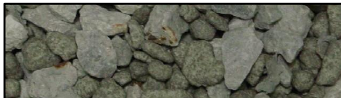
Figure 2. Permeability of Select Blended Barrier Formulations