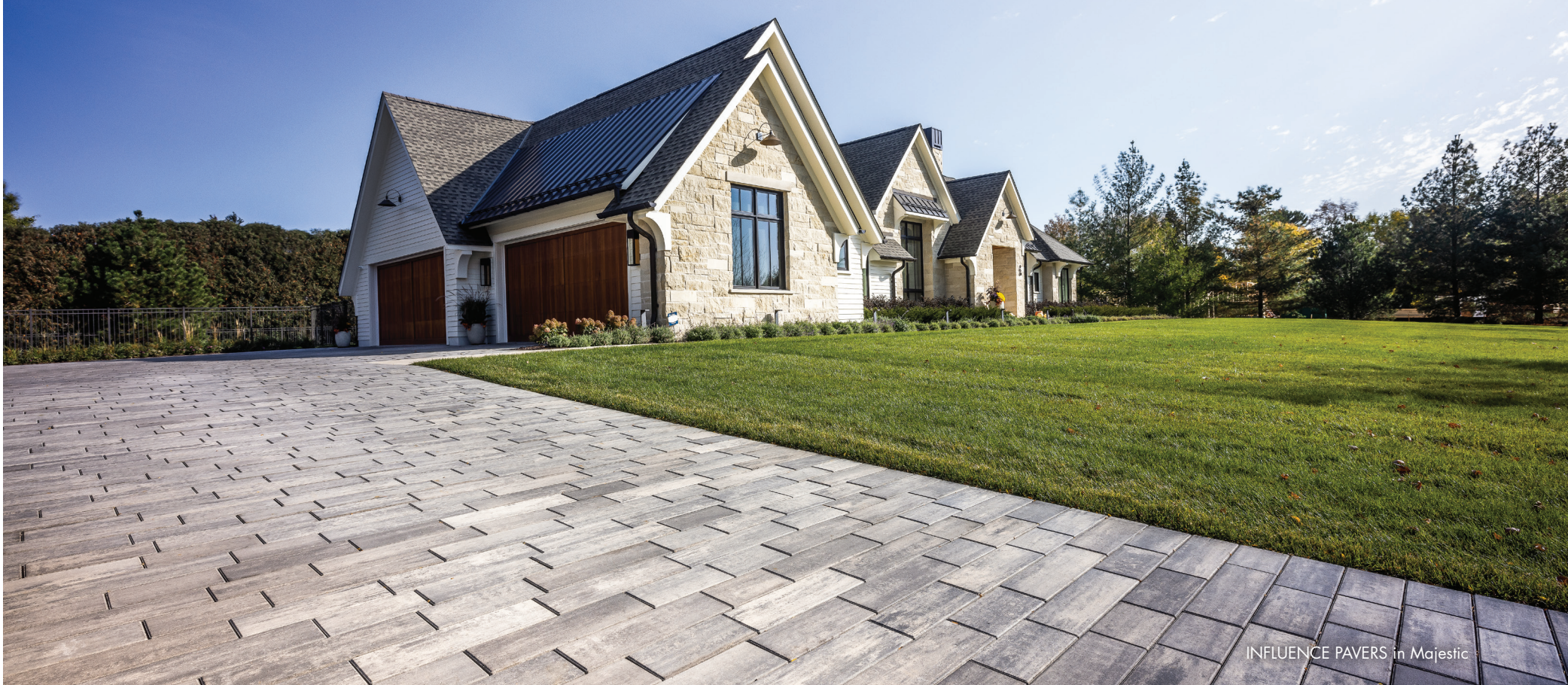
INFLUENCE PAVERS in Majestic