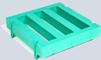
2" x 10" large opening, 50mm thick panel